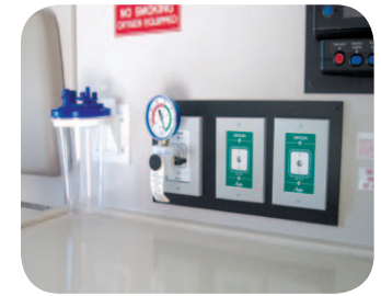
Three Oxygen Outlets