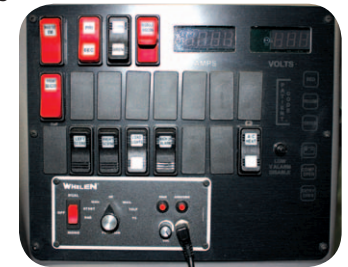
Paragon Electrical System

Due to constant product improvements; specifications, component parts and optional equipment are subject to change without notice or obligation. Photos may show optional equipment.