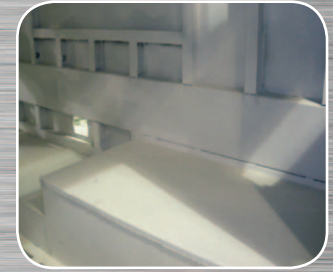
Side Impact Beam